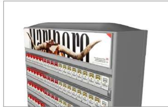
Lit header system with dimensional cap.

2', 3' & 4' full fixture widths with shelf trays. Easy planogram modularity. Signature dimensional lit header. Unique header cap.